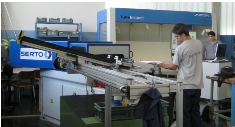
Bending machine and TubeInspect applied at Serto AG, Switzerland

ment in comparison to the old measuring principle. However, it had several drawbacks: A measurement took quite a long time. This obstructed our smooth work flow. Moreover, the setup of the bending machines was rather time consuming when we didn't have any CAD data of the tubes and therefore had to wait for the measuring data of the samples. Additionally, we encountered some problems with respect to measuring accuracy. When two people conducted the same measurement with the articulated arm, we got two different results. And finally, we could only measure tubes up to 1.20m in length with the arm. In order to measure longer tubes, we would have had to rearrange it every time which would have caused another loss of accuracy. That was not acceptable."